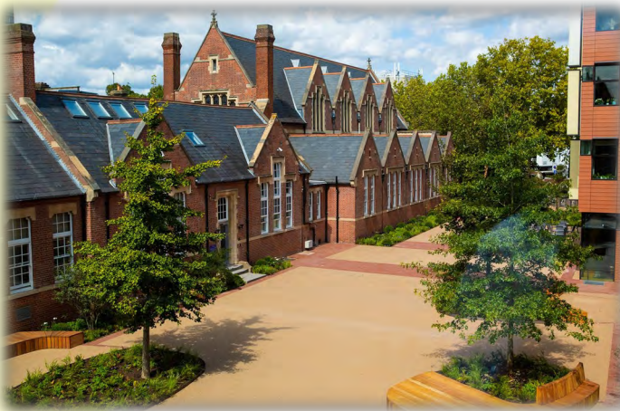
Latymer Upper School courtyard

Welcome to the TBMH Saturday Music School. We are very excited about the year ahead and pleased to welcome you all to music lessons at Latymer Upper School for the 2023-2024 academic year.