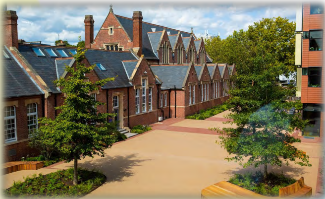
Saturday Music School takes place at Latymer Upper School