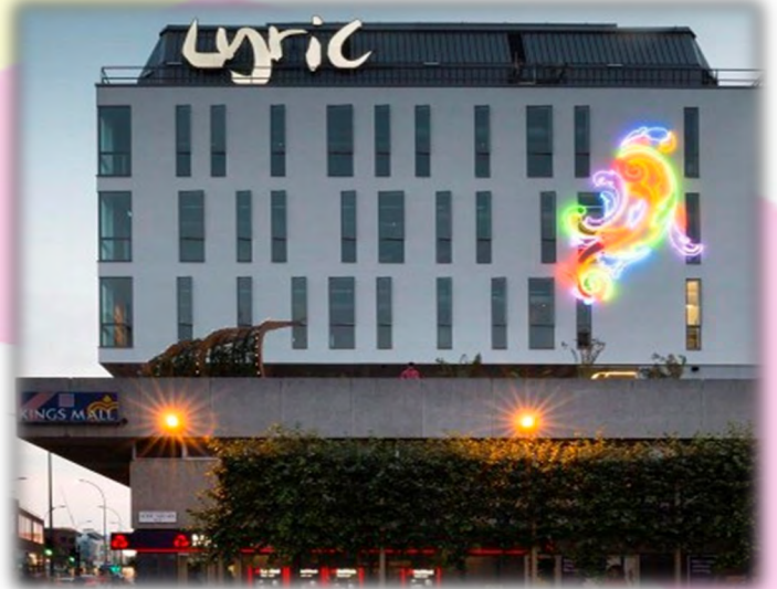
Weekday classes are held at The Lyric Theatre, Hammersmith